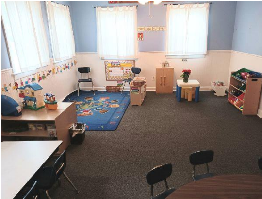
New 3 Year Old Classroom!

“Let the little children come to me and do not hinder them, for the kingdom of God belongs to such as these. ’...And Jesus took the children in his arms, placed his hands on them and blessed them.” (Mark 10:14, 16)