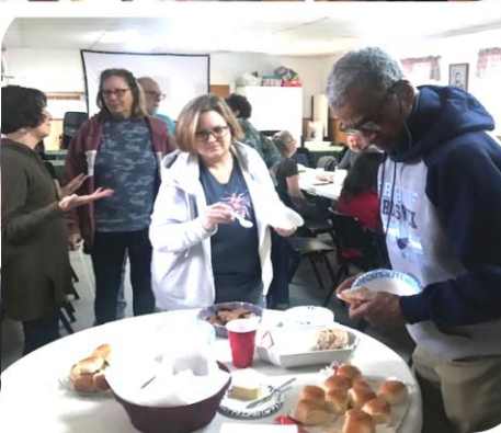
Wednesday Dinner Church!