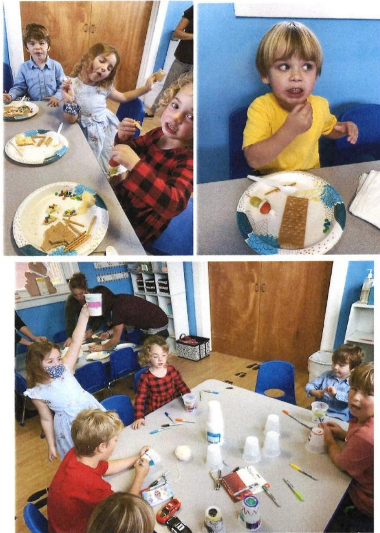
Christmas Celebration: making ornaments and gingerbread houses!

The Children's Ministry at Kure Memorial Lutheran Church has grown so much this year! It has been a pleasure seeing the program evolve and I look forward to continued growth this next year. I invite you all to check out the following link to a video which highlights the memories of our Children's Ministry at KMLC for 2021! https://www.youtube.com/watch?v=KvvaxeCQsgw