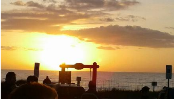
Sunrise on Easter Morning!

“In him was life, and that life was the light of all mankind. The light shines in the darkness, and the darkness has not overcome it.” (John 1:4-5)