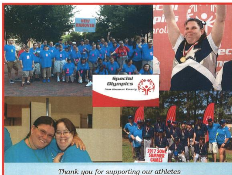
Thank you for supporting our athletes

On behalf of the more than 600 athletes who participate in Special Olympics New Hanover County, we would like to thank you for your generous donation. The support of local citizens and businesses is what helps keep our program active and able to provide athletic training, social events, travel, and more—at no cost to our participants. We truly could not continue to offer these services without the help of our community, including generous contributors like yourself.